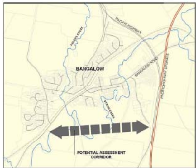
Potential bypass corridor RTA concede as feasible. See report at: www.arup.com.au/tintenbar/files/080118_Strategic_Access_Report_Website.pdf